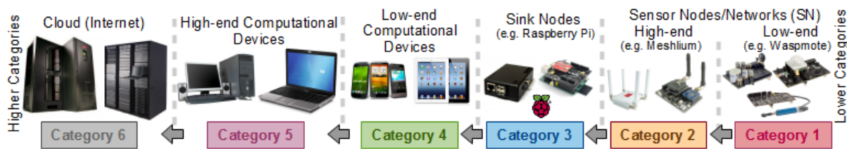
Figure 3: Categorization of IoT devices based on their computational capabilities.

In Figure 3, we illustrate a range of devices with different capabilities. We have grouped some commonly used devices in the IoT domain into a few different categories. Please note that this categorization is not done formally using any strict criteria. However, it approximates the differences between different groups in terms of the capabilities of the devices. The devices belonging to each category have different capabilities depending on processing, memory, and communication. They are also different in price where devices become more expensive towards the left of the figure. The computational capabilities also increase towards the left. Cloud computing is represented by Category 6 and rest of the categories may act as edge devices based on the context.