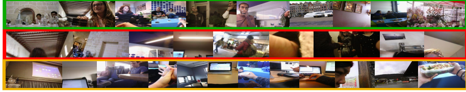
Fig. 1: Examples of Positive (green), Negative (red) and Neutral (yellow) images.

the different sentiment ontologies in the literature. Table 1 illustrates the ambiguity of the problem, reporting several sentiments ontology in images. The first group [13,21,18] assigns 8 main sentiments as excitement, awe or sadness to the images with assigned discrete positive (1) and negative (-1) sentiment value. The second group [4,10] defines a different set of sentiments as valence or arousal and discrete positive (1), neutral (0) or negative (-1) values assigned to the images according to the sentiments. In contrast, the third group [14] assigns up to 17 sentiments (6 basics and 9 complex) and each image of the dataset is assigned a continuous value in a scale from 1 to 4. Given the ambiguity of the semantic sentiment assignment, with labels difficult to classify into positive or negative sentiments, the last group [1] defines up to 3244 Adjective Noun Pairs (ANP) (e.g. 'beautiful_girl') and assigns a continuous sentiment value in a range of [-2,2] to them. The main idea is that the same object according to its appearance has positive or negative sentiment value like ' angry_dog ' (-1.55) and ' adorable_dog ' (+1.45). A natural question is until which extent the 3244 ANPs represent a scene captured by the image, taking into account the difficulty to detect them automatically (Mean average accuracy \sim 25\% ).