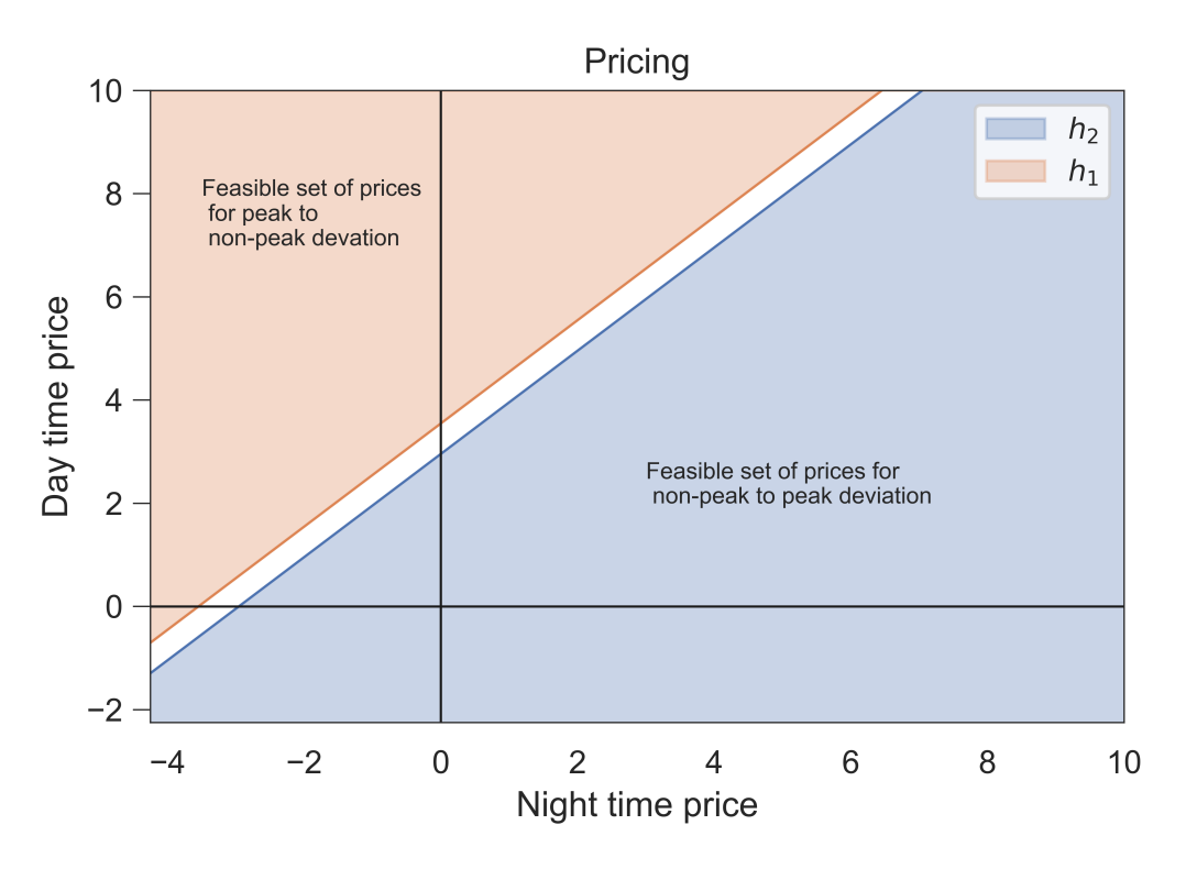
Figure 3: No feasible price profile exists.