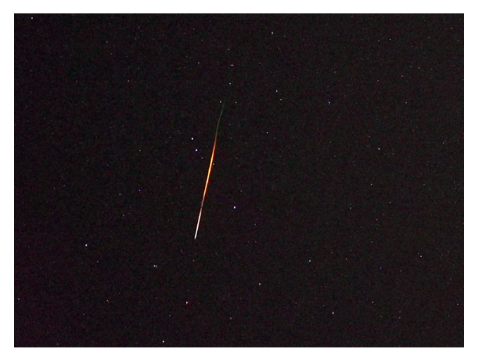
Figure 1 – The brightest Tau Her meteor detected by us on the 31st of May 2022. We estimated its brightness to be -2 magnitudes as it passed through Corvus.

This year, we present a continuation of our efforts, expanding upon the initial findings and offering a more comprehensive analysis of the Tau Herculids. Our observations have yielded a population index of r = 5.56 \pm 1.83, a figure that stands out when compared to other published values. This discrepancy, we hypothesize, could be attributed to the heightened sensitivity of our observational equipment, particularly adept at detecting fainter meteors. Furthermore, we have refined our measurements of the radiant position of the meteor shower the most luminous meteors accurately. Additionally, for the mid-time of our observations.